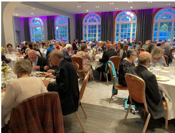
The packed dining room at Hawkstone Park Hotel