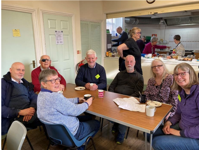
Local ringers enjoying a rest

The Shrewsbury band played host to a heat of the National Twelve Bell Competition on 22 nd March, at St Chad's church. The weather obliged, the ringing was glorious, and we all had a splendid, if hard-working, day. Lots of ringing friends dropped by for a listen and a chat. The catering team demonstrated that, although we don't have a 12 bell band good enough for the competition (yet), we can certainly meet the standard for excellent cakes, not to mention bacon butties.