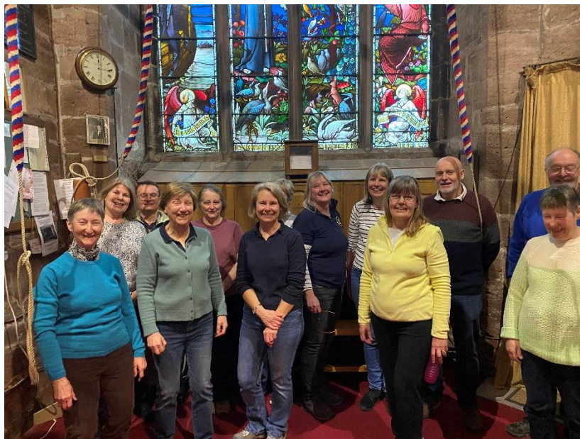
Some of the March students and teachers